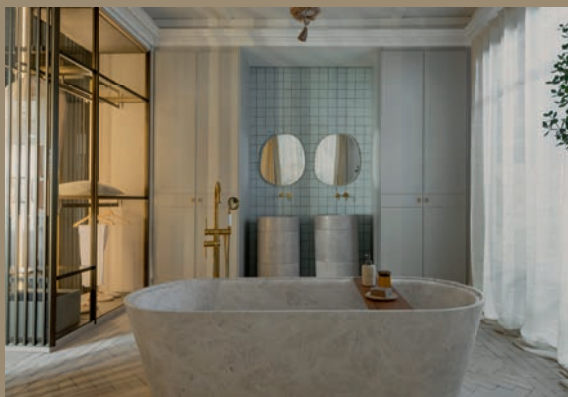
Villa Javad Modalal in Dubai (UAE) | Arquivo